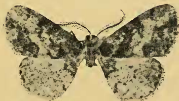
Fig. 6. Obolcola lindneri n. sp. holotype ♂ (× 3).

slender and dentate, marked only on posterior half of wing. Terminal interneural spots on both wings black. Underside patterned similarly to upperside, but both wings much paler, the cinnamon irroration being much reduced, especially on the fore wing.